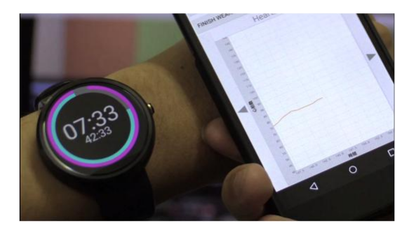
Figure 2. Wearing a smart-watch on the wrist

Figure 2 shows a user wearing the smart-watch on the wrist and running the application. The application can indicate notices such as vibration, showing messages/images on the device's screen when the rate of heartbeat exceeds a particular value which was set in advance. When rate of the heartbeat falls, the reason is because it is thought that I am in a tense state during an angry time.