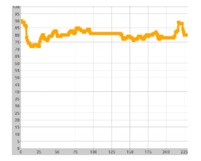
Figure 4. A graph of captured heartbeat on a smartphone screen

smart-watch application, the smart-watch sends this data to the smartphone. On the smartphone side, the smartphone draws a graph on screen using the received heartbeat rate data. The graph is capable of enlargement, reduction and movement, because when you want to watch whole or detail of the graph, expansion reduction and movement to the side are necessary. Figure 4 displays the numerical value that I measured with a smart watch as a graph to the screen of the smartphone. We think that the raise and downs of heartbeat may be normal by making the value that I measured a graph. In addition, smartphone creates a data file of the heartbeat rate. This data file can be accessed by other applications and devices such as another smartphone, computer and so on. It is able to share heartbeat data and see the same graph or data.